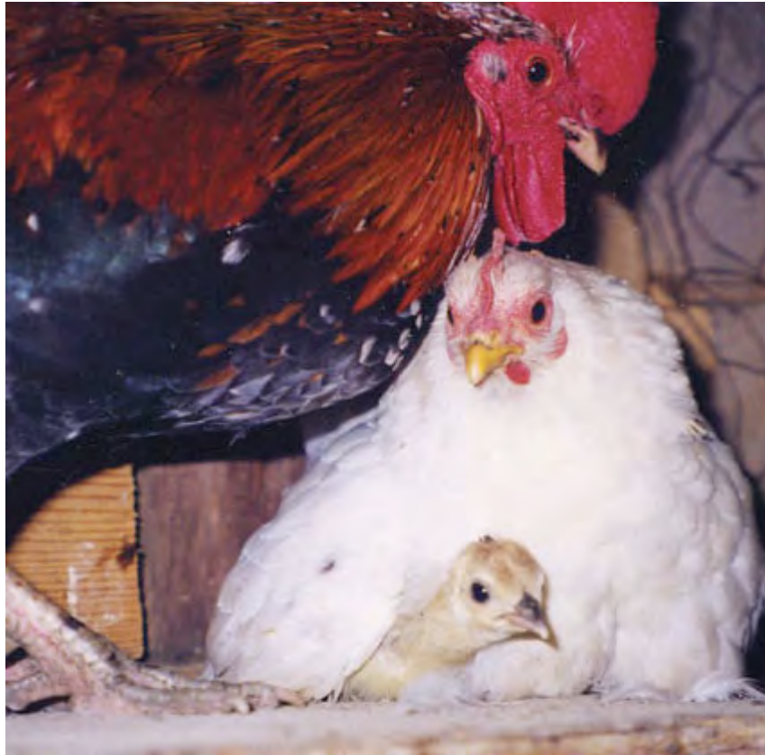
Rooster Lincoln, hen Sno-Pea and chick Luv-Bug

MOTIVATION: Ask the children to name the birds they know. Ask them how they know it's a bird.