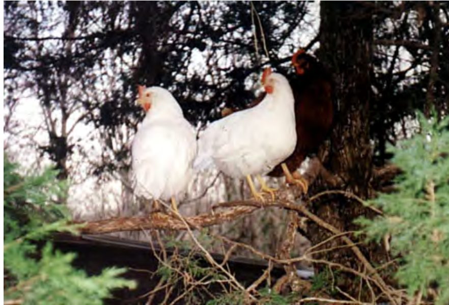
Hens roosting in trees at United Poultry Concerns Sanctuary

United Poultry Concerns, P.O. Box Box 150, Machipongo, VA 23405 Phone #: 1-757-678-7875